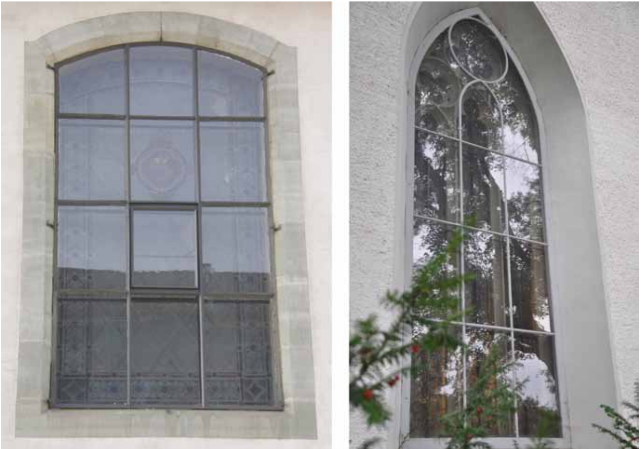
Fig. 1. Unventilated protective glazing fitted in a metal or wood frame: 'Église des Capucins' in Romont, installed around 1950 (left); Parish church of Frauenfeld-Oberkirch, installed probably before or around 1900 (right).

Those authors provide interesting insights into the energy efficiency of various insulation measures (including double glazing) in churches. They also point out that, among the various options to improve energy efficiency, the thermal insulation of a church's roof and floors, as well as the replacement of old heating systems, usually provides much more potential for energy saving than the installation of protective glazing. Their conclusions draw on the evaluation (from a conservation as well as an energy perspective) of heating systems in churches (see, for example, Schellen 2004; Limpens-Neilen 2006). They also draw on the development of sustainable heating concepts such as 'friendly heating' (Camuffo and others 2010), which have found their way into various guidelines, textbooks, and standards on how to heat historic buildings appropriately (for example DIN EN 15757). Yet, despite these findings, church owners in Switzerland are reluctant to review the options to reduce heating costs (for example, by reducing temperature set