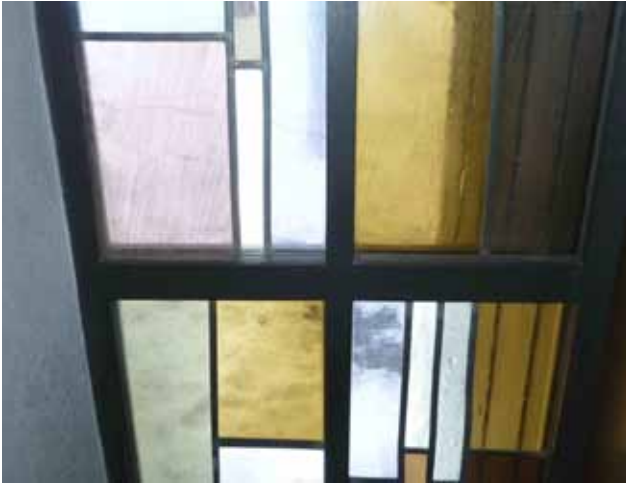
Fig. 4. Type of double-glazed protective glazing known as 'sandwich glazing', installed around 1990.

Over the years, the silicone sealing begins to leak, leading to condensation on the stained glass.