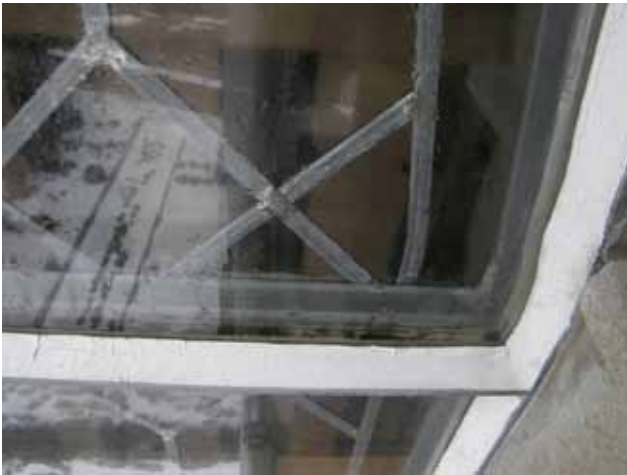
Fig. 2. 'Bonded' protective-glazing system: stained glass fitted in a metal frame together with the protective glazing, installed around 1970.

It is usually unventilated, although such protective glazing is rarely perfectly airtight. The interspace between the stained-glass window and the protective glazing normally ranges between 10 and 30 cm, depending on the width of the window reveal. The framing is usually delicate. Occasionally, the drawn glass has been preserved, and the stained glass has remained untouched in its original place. Our observations show that this type of protective glazing is still effective in protecting the stained glass. Because of the limited extent of external ventilation, these systems have created very good climatic and conservation conditions for (at least certain types of) stained glass.