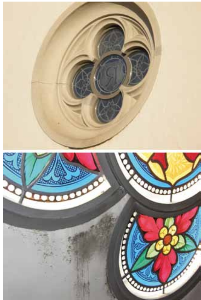
Fig. 3. Protective glazing fitted with a double glazing unit: outside view (above) and inside view showing fungal growth on the walls surrounding the stained-glass window (below).

Another type of protective glazing became common in the second half of the twentieth century. Here, the stained glass is fitted in a metal frame together with the protective glazing to form a new type of 'bonded' glazing; the interspace between the stained glass and the protective glazing glazed with a single glass sheet is usually less than 4 cm and normally unventilated. This leads to condensation on cold surfaces in the interspace: in winter on the inner side of the protective glazing, and in summer on the outside of the stained glass and the lead comes (figure 2). Another problem associated with these 'bonded' systems is that structural changes have to be made to the historic windows. For example, the stained glass has to be trimmed to fit the new frame, and historic armouring usually has to be removed. Finally, a type of protective glazing that has found increasing use since the 1980s consists of unventilated systems that combine the stained glass with double-glazed units (figure 3). Practical experience shows that the fitting of such sys-